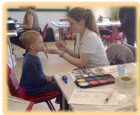
Caerphilly Families First painted 49 children's faces and offered families goodies bags including: water bottles, Frisbees, keyrings, pens, leaflets and balloons!