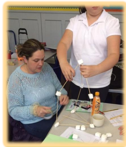
Investigating 3D structures

Families in our junior groups have been developing their literacy and numeracy skills through mini design projects. Each week the families have been given a different challenge to make, test and evaluate. So far they have made kites, rockets, table football games and marble runs. These innovative sessions have engaged with families and have provided unique and high quality learning experiences for the whole family.