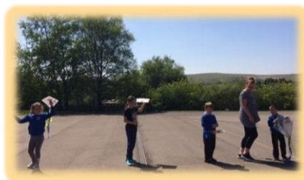
Ready to test our kites!