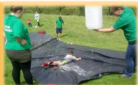
Families building wooden bird boxes and children enjoying the slip-and-slide!