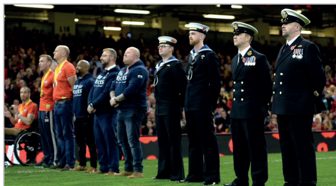
Help for Heroes Band of Brothers Fellowship members join serving personnel and Invictus athletes to commemorate 100 years since the end of World War I at the Principality Stadium

For more information about support in Wales visit: www.helpforheroes.org.uk/get-support/how-to-access-our-services/recovery-in-wales/ Call: 01443 808910 email: wales.supporthub@helpforheroes.org.uk