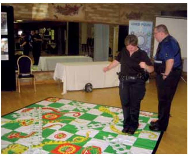
Community cohesion showcase event

The outcomes are grounded on the principles of Equalities and Welsh Language, Sustainable Development, Early Intervention and Prevention Goals, and Community Cohesion. Caerphilly Delivers provides the delivery framework for achieving the outcome areas up to 2017. The Single Integrated Plan has been one of three priority work areas for Caerphilly Local Service Board, alongside tackling Child Poverty and Alcohol Abuse.