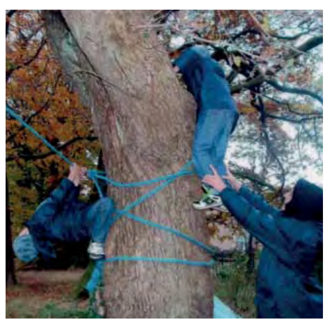
Adventure and creative play