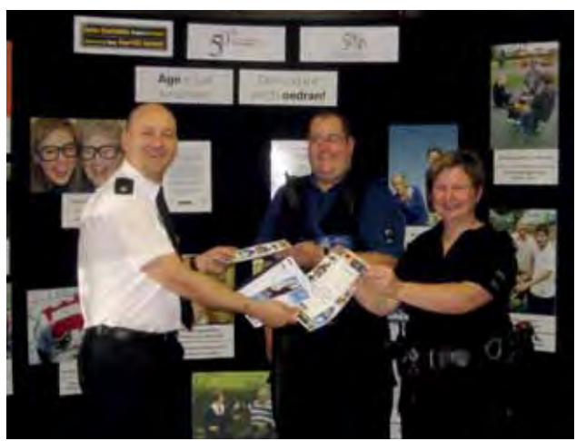
Community Cohesion Showcase event

Regular progress on the Compact is also available at: http://your.caerphilly.gov.uk/communityplanning/content/voluntary-sector