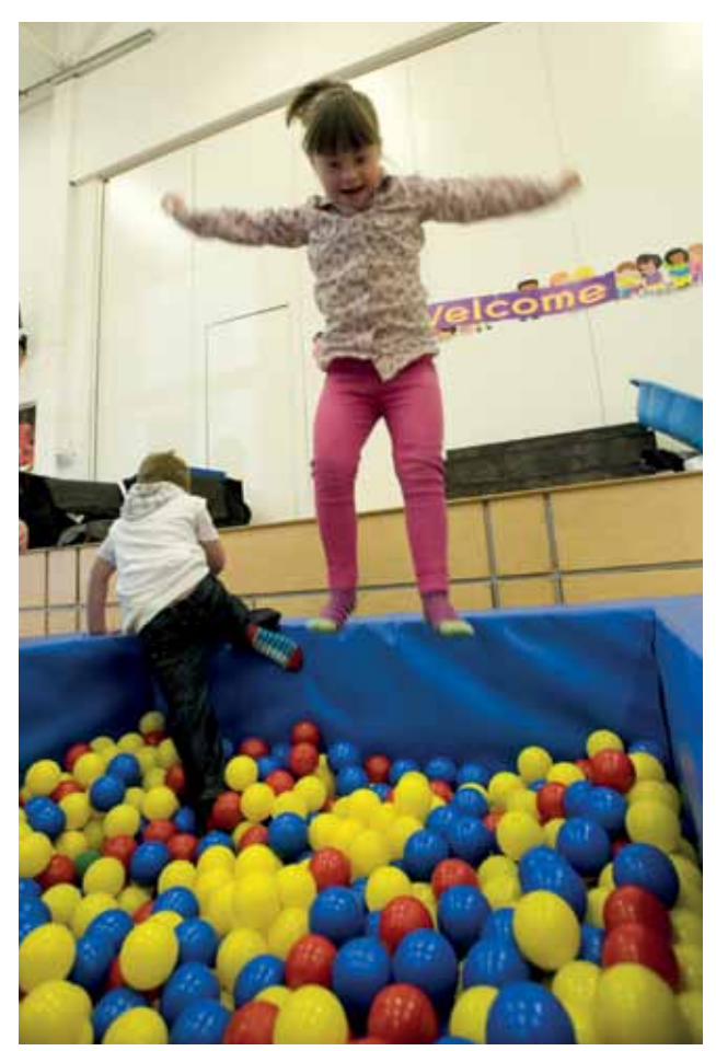
GAVO Play Team, Pengam Fun Day

Although advance payments currently contravenes the financial regulations of CCBC, some funders are able to make payments in advance where need arises. This is helpful for small VCS with