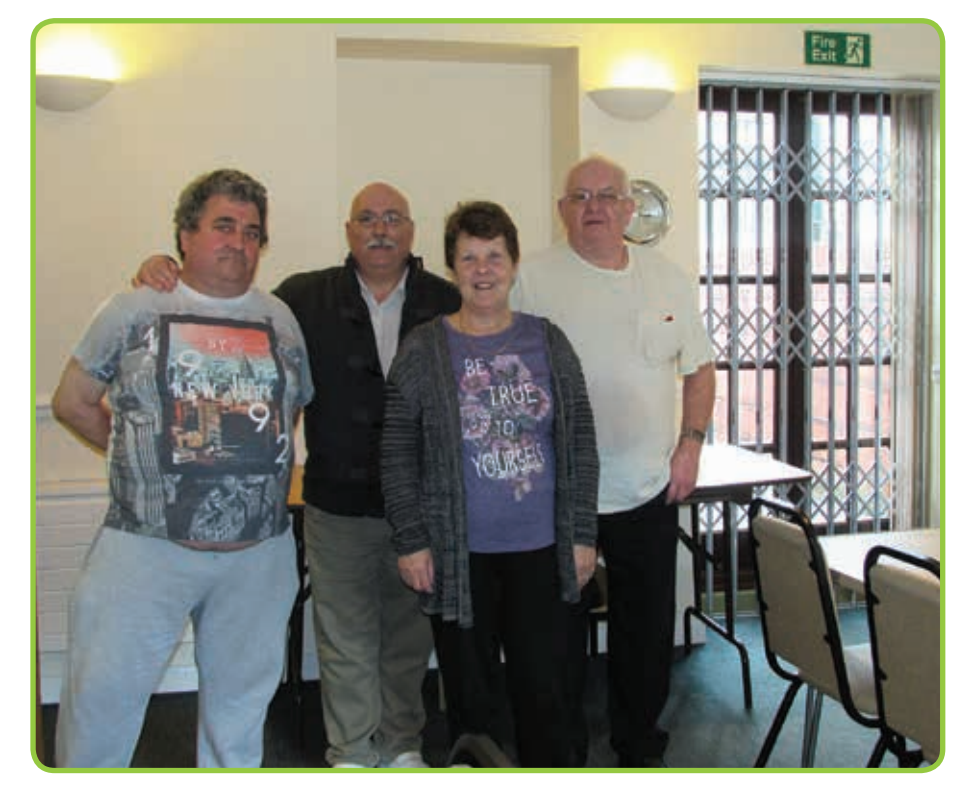
The community group in one of the newly decorated rooms

Caerphilly Homes' single source supply partner, Robert Price Builders' Merchants, donated paint and decorating equipment to the community house along with a brand new timber shed. Volunteers from Wales and West