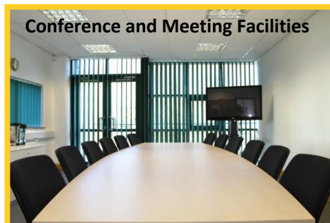
Conference and Meeting Facilities