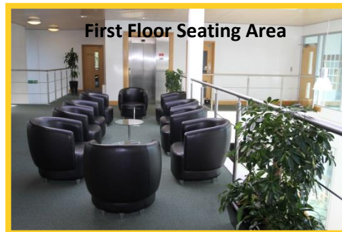
First Floor Seating Area