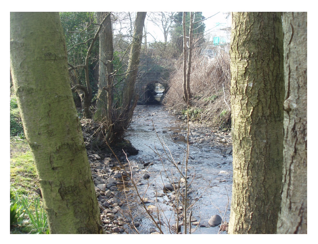
Natural Watercourse and Culvert

5.3 Clause 3.3.4 of the guidance document advises that high level strategic objectives should be developed around the reduction of potential adverse consequences of flooding for human health, the environment, cultural heritage, economic activity and, if considered appropriate on local community facilities, non-structural initiatives and/or on the reduction of the likelihood of flooding. By adopting this approach, the objectives will be consistent with those required under the Regulations and will assist in ensuring that this common approach is maintained across Wales.