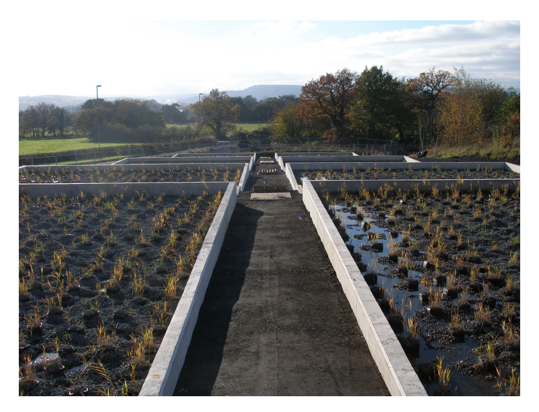
Construction of Reed Beds