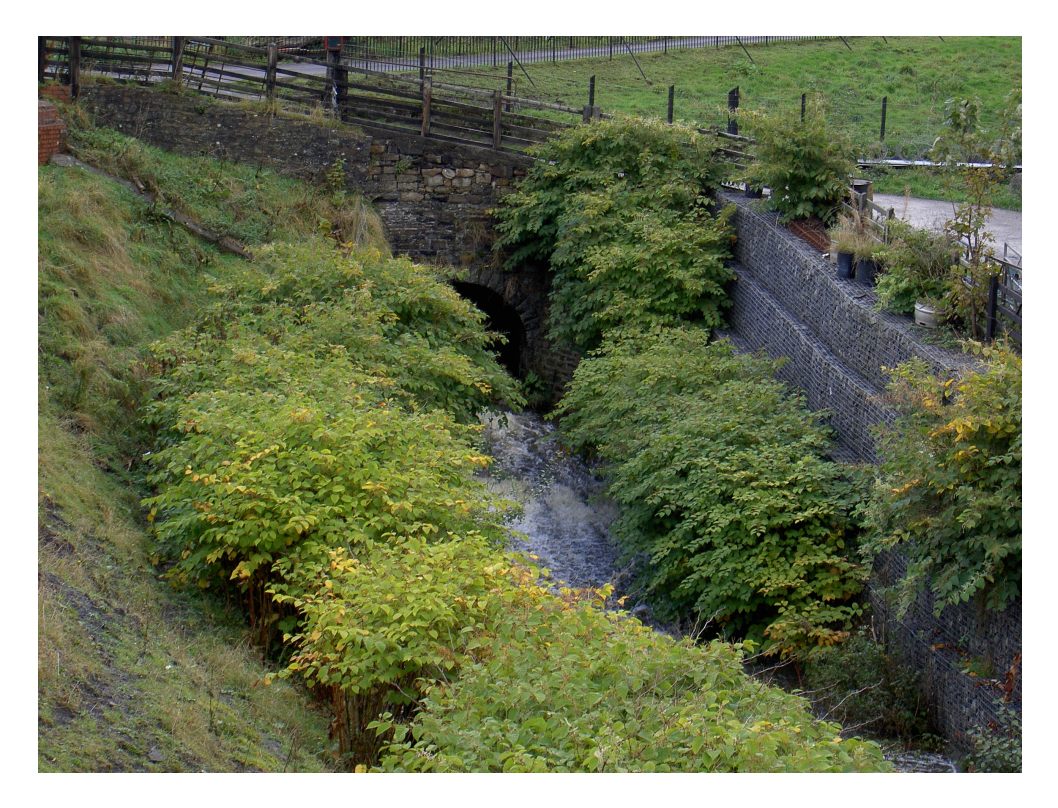
Invasive Species - Japanese Knotweed