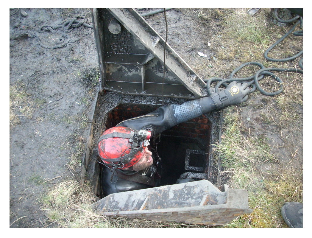
Investigation of Drainage System