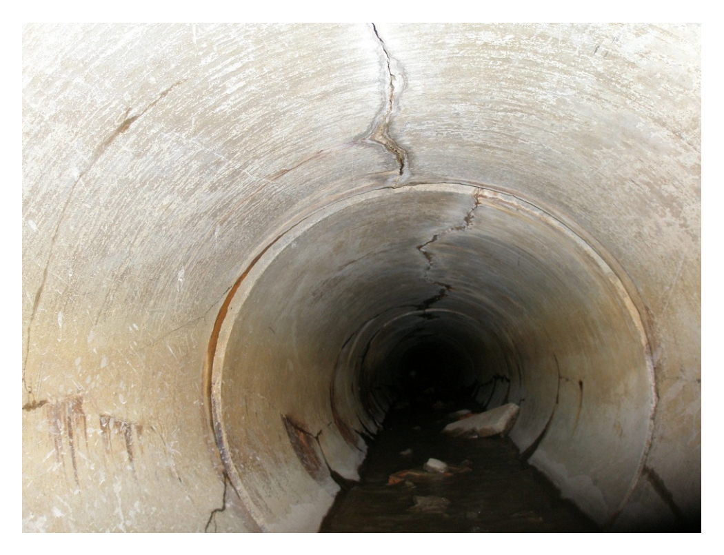
Funding required to replace aging culverts

8.4 When considering the works required in delivering their Strategy, CCBC will be mindful of work ongoing to deliver the National Strategy, and also of works carried out by other organisations in the area, particularly other Risk Management Authorities. Early engagement with other Risk Management Authorities will assist with this by providing an opportunity to share information and gain a better understanding of the work program for each partner accordingly.