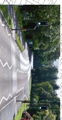
Typical image of proposed new crossing facility.